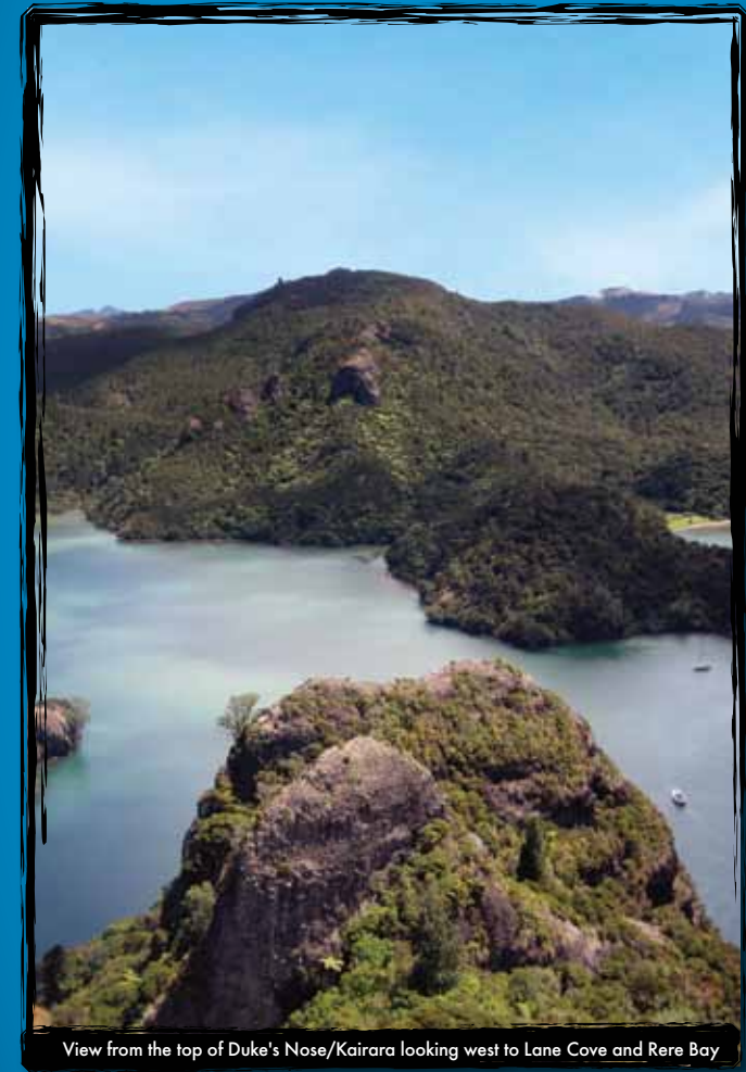
View from the top of Duke's Nose/Kairara looking west to Lane Cove and Rere Bay